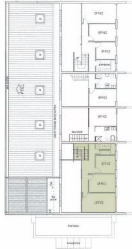
SECOND FLOOR PLAN - MEZZANINE SCALE 1:50