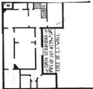
First Floor, Suite 4 (194sqm)