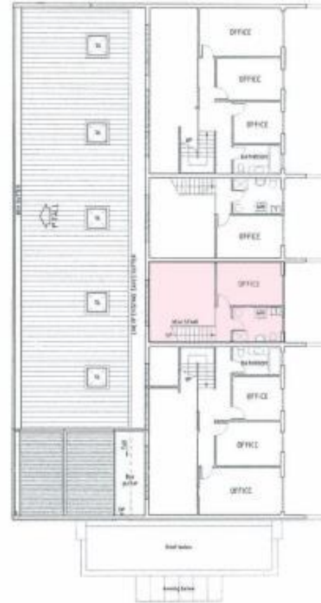
SECOND FLOOR PLAN - MEZZANINE SCALE 1/8"